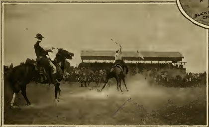
A HARD ONE.